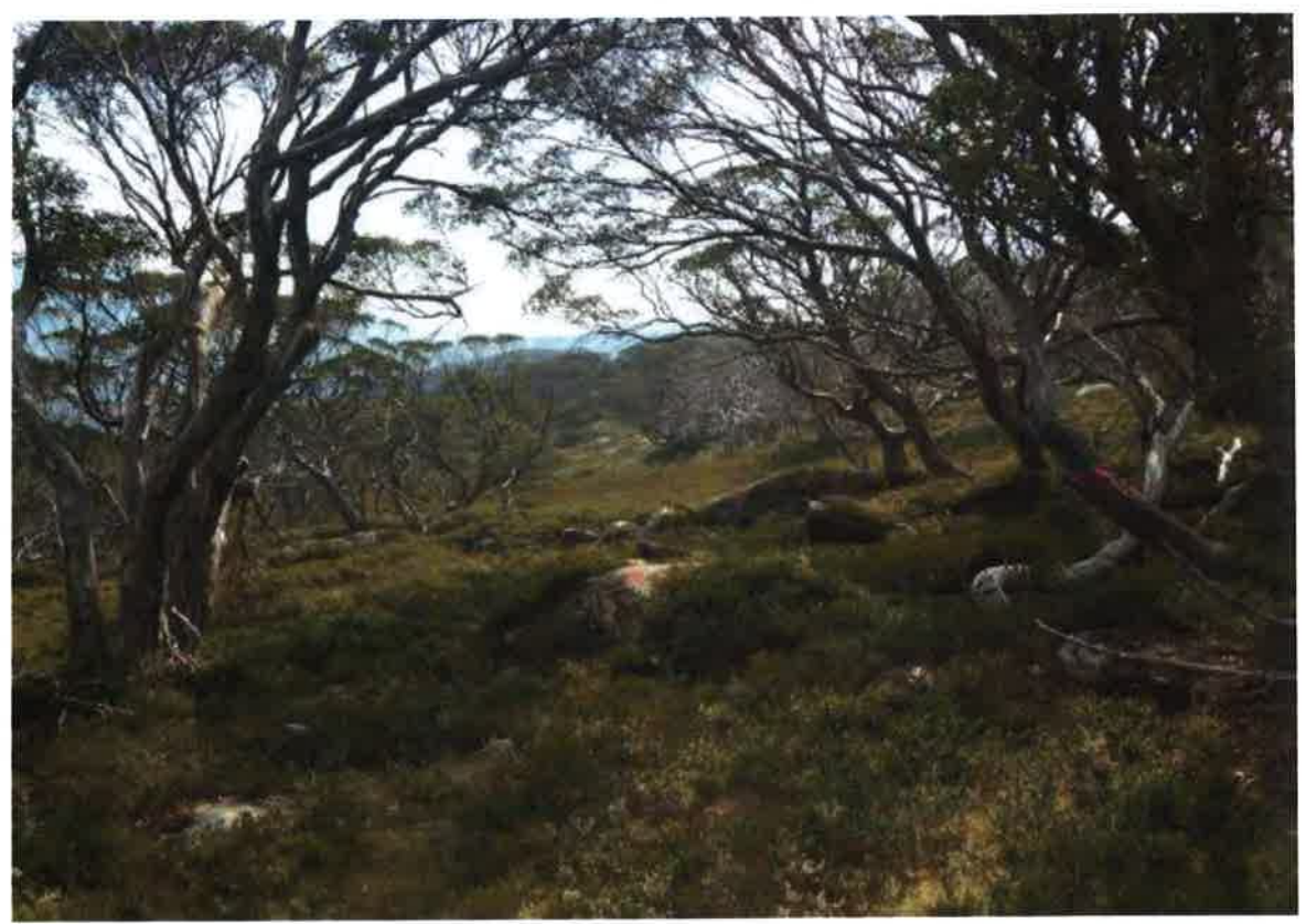
Photo 5: The location where the traverse crosses a boulderfield. In this area the tops of six boulders will be reduced.