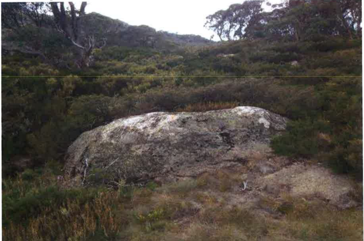
Photo 4: The rocks to be treated will be reduced in size with fragments placed around their bases. Vegetation is typically crushed by the weight of the groomers against the rocks, so it is likely that, in the medium term, there will be more vegetation around the affected rocks.

Photo 3: The rock removal will be limited to 56 rocks along the route of the traverse that rise above the vegetation and, as evidence by scratches, are already scraped by groomers.