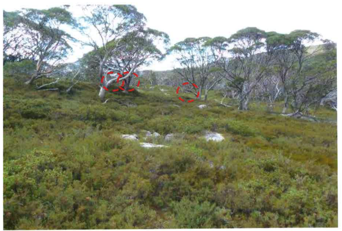
Photo 1: The proposal involves strategic tree, tree limb and rock removal to improve the capacity for snowriders to use the Powder Valley Traverse.