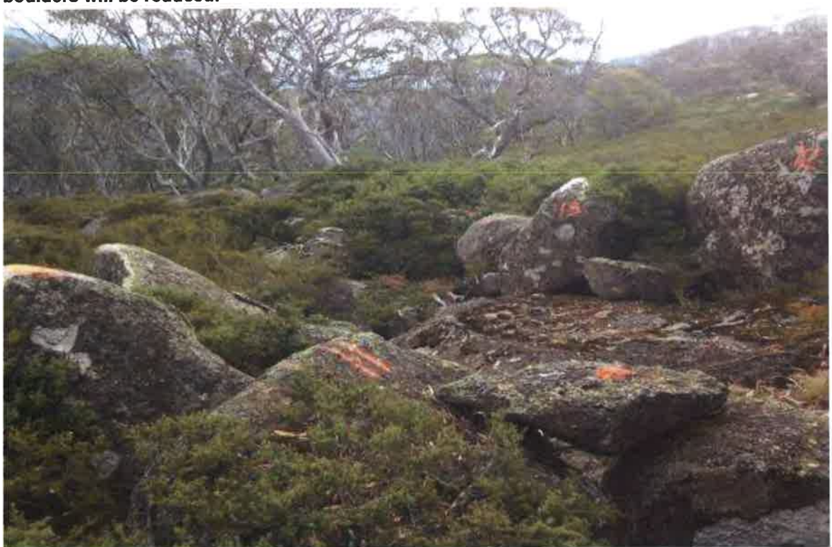
Photo 6: The boulderfield shown in Photo 6, showing the group of large boulders and the vegetation growing over them. The absence of vegetation and scratching on the tops of the boulders is indicative of the damage associated with existing grooming activities.